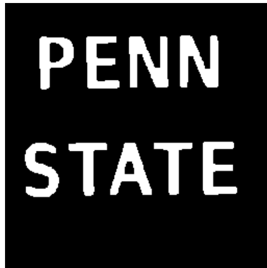
Figure 2: Filtered form of Figure 1 (Q. 1a)